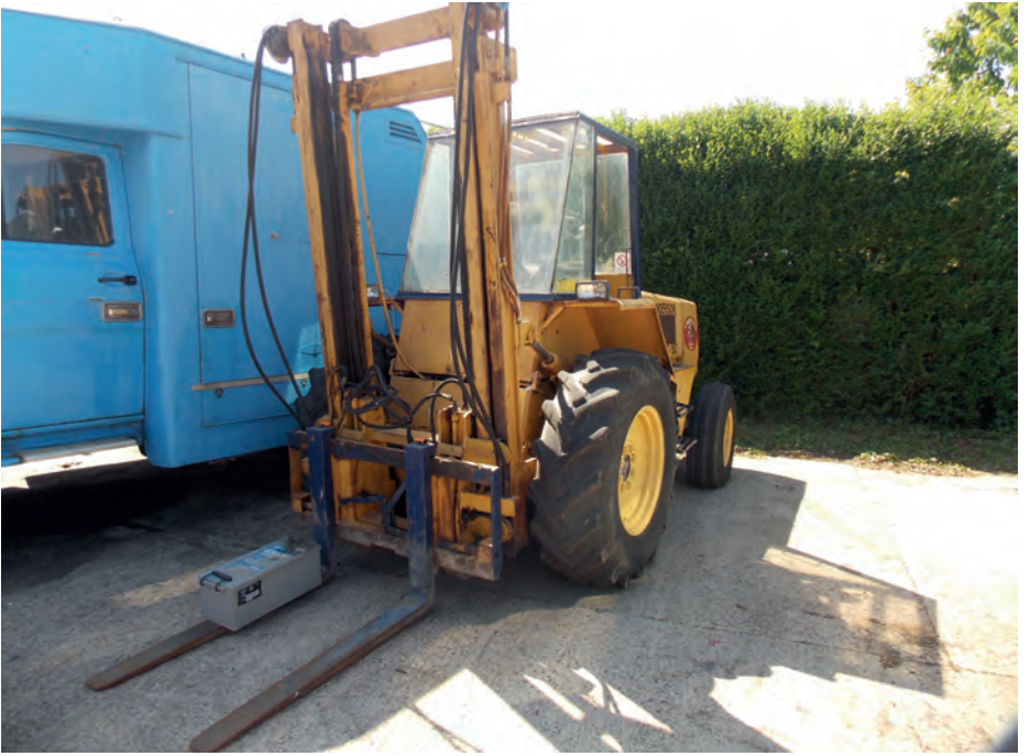
m241 1979 Sanderson SB50 all terrain forklift