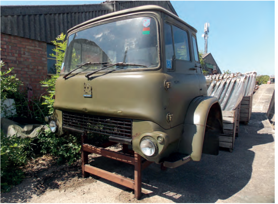
m208 Bedford TK/KM 1630 RHD cab, Ex-MOD

All lots are sold strictly as seen and without warranty, potential purchasers must satisfy themselves as to the true condition of a lot by personal inspection prior to the sale.