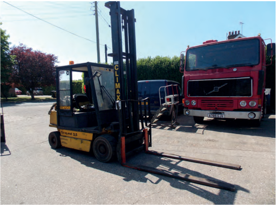
m239 Climax Conquest 2.5tonne fixed mast diesel forklift Fitted with cab

All lots are sold strictly as seen and without warranty, potential purchasers must satisfy themselves as to the true condition of a lot by personal inspection prior to the sale.