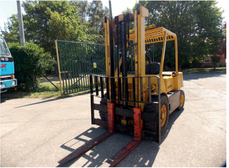
m240 Hyster diesel forklift Fitted with Perkins 4cylinder engine

All lots are sold strictly as seen and without warranty, potential purchasers must satisfy themselves as to the true condition of a lot by personal inspection prior to the sale.