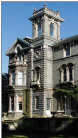
Recent Country House Collections Sold Successfully At Cheffins