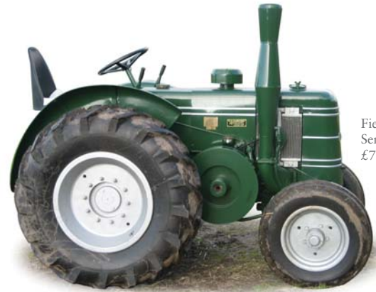
Field Marshall Series II. £7,000 - £9,000