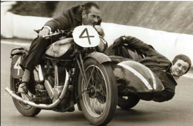
Blokes having fun yesterday.

Just hark back to your youth when your first moped gave you your initial taste of freedom and the ability to relate improbable tales of unlikely speed. Eventually your need progressed and your first motorbike was attained. At the time that seemed fast enough but familiarity, and all that, requires the purchase of the next bigger bike - surely no need to go faster?