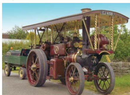
1920 Aveling & Porter Ltd Class KND 4hp compound steam tractor. £130,000 - £160,000

The same sort of emotions can take hold of the tractor brigade as well, starting out with the humble "Grey Fergie" and the pleasant rural idyll that such vehicles invoke. Then the need for power is deemed unsatisfied until onlookers have to crick their necks to see you sat atop something the size of a block of flats.